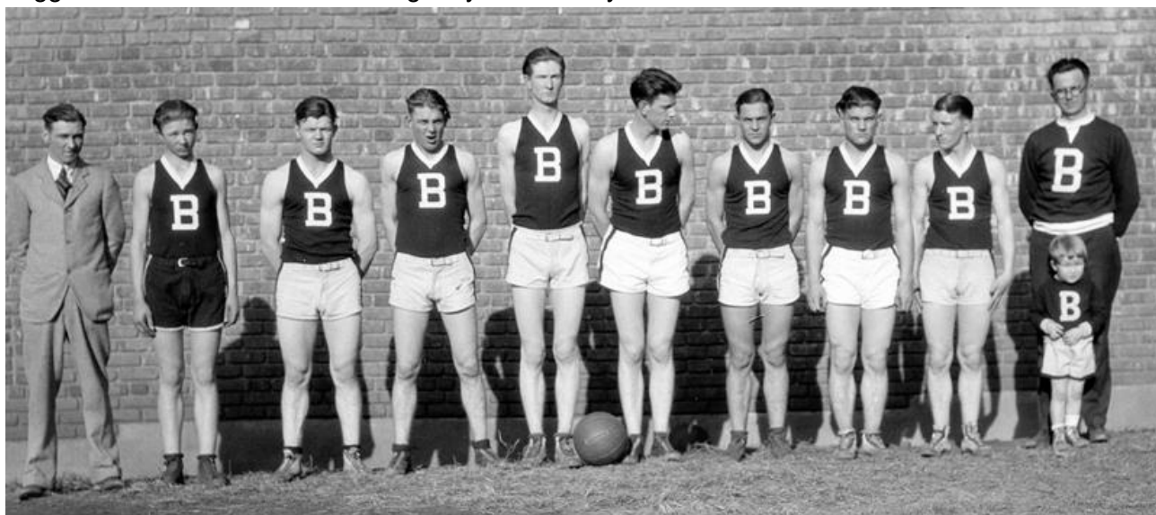
Bryson City High School boys, 1926-27.