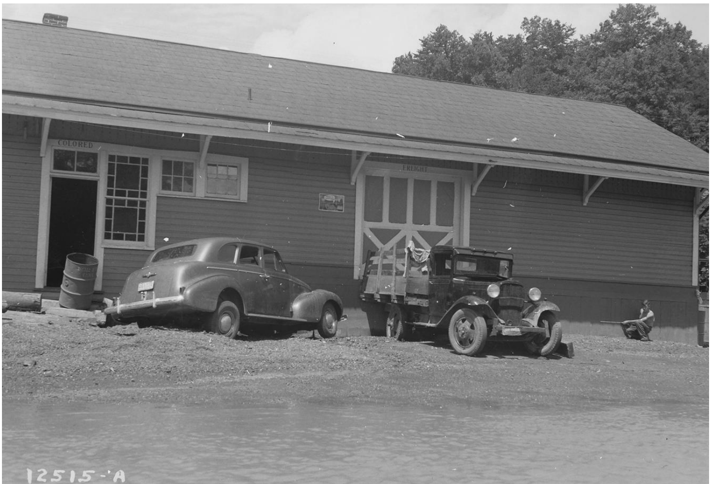
Boy at right shows the flood high water mark at the depot. Note "COLORED" above the door at left.

I suspect that there was an unspoken rule or understanding that the youth sports leagues were not open to black kids. I recall a few Cherokee kids played baseball. If it had been kids organizing the teams, would black kids have been allowed or encouraged? I'd like to think so, but there's no way to know now.